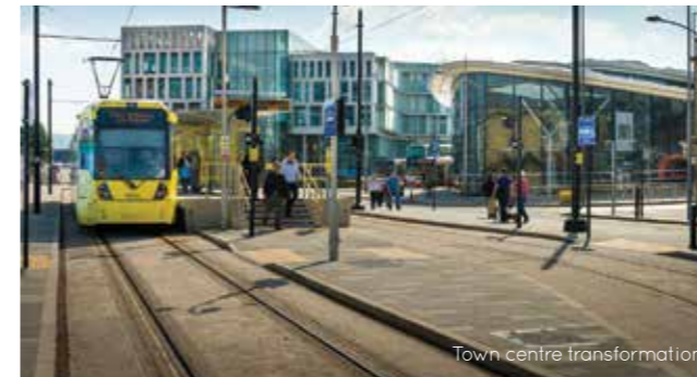
Town centre transformation

Visit www.rochdaletowncentre.com or follow @RochdaleCentre for the latest.